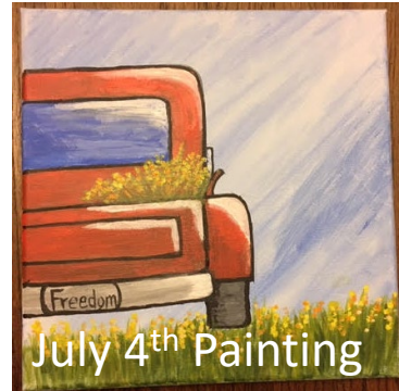
July 4 th Painting

Hope the time off school has been good. Have you tried any new Hobbies? Books? Videos? We'll have to catch up.