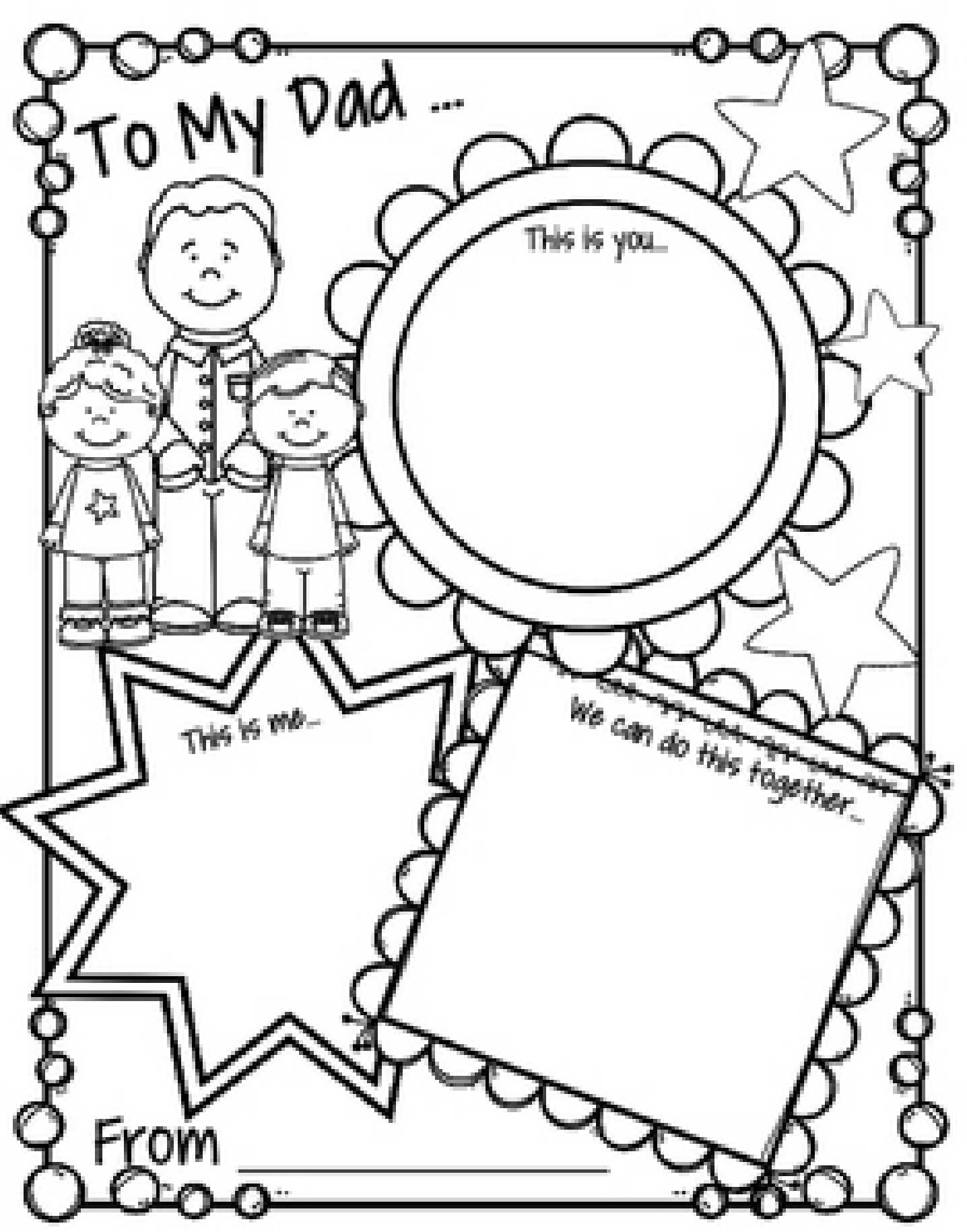
A Father's Day Craft to give your dad or other important person in your life.