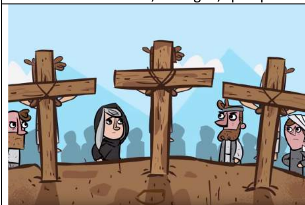
9. Jesus dies on the cross.