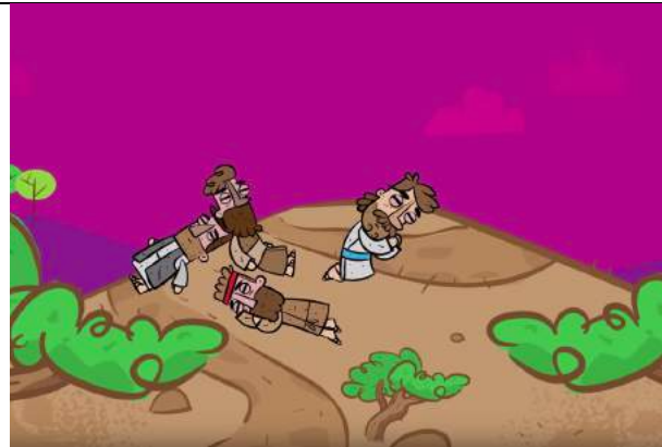
3. Jesus prays in the garden.