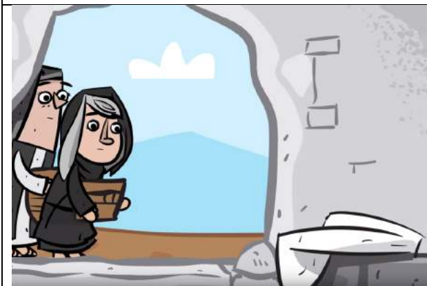
11. The tomb is empty.