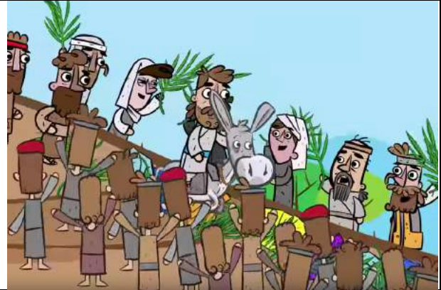
1. Jesus' triumphal entry into Jerusalem.

Print out the following pictures. Cut and insert each one into a plastic egg. (Omit the captions). After the egg hunt, have your child(ren) put the pictures in sequential order.