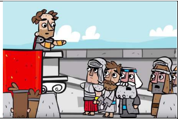
6. Jesus is taken to the Roman governor.