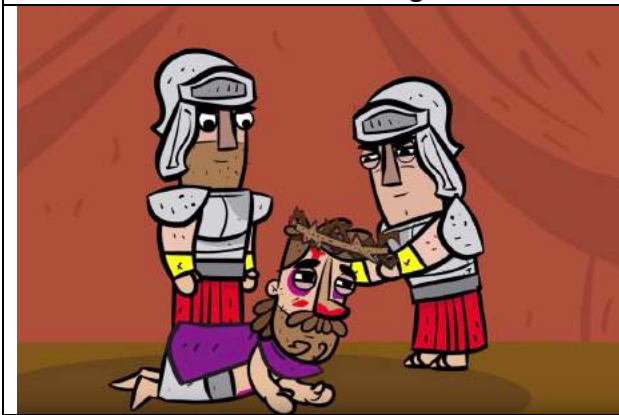
7. Jesus is beaten, scourged, spit upon.