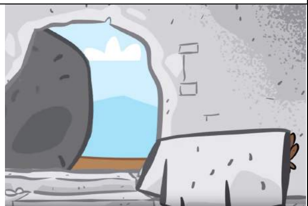
10. Jesus is laid in a tomb.