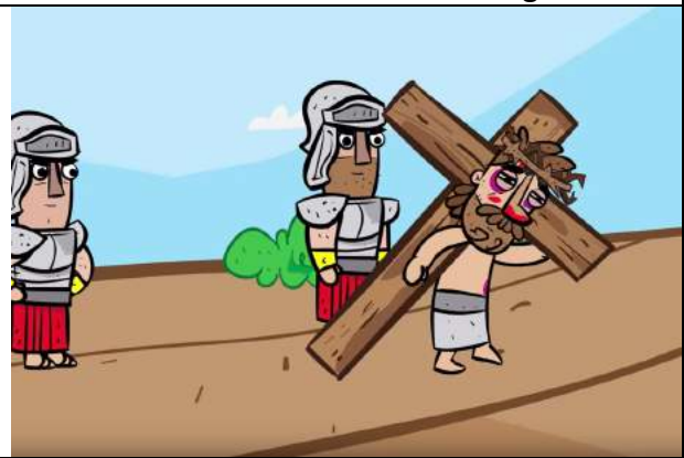
8. Jesus carries his cross.