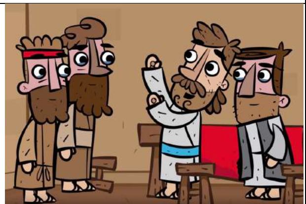
12. Jesus is alive! He appears to his disciples.