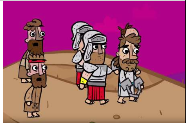
4. Jesus is arrested.